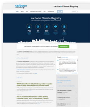
The cCR website

In addition to a city's profile, a city must include at least 3 of the 4: (1) targets and commitments; (2) action plan(s); (3) a GHG inventory; and (4) mobility actions. The first 3 items are covered within the main reporting sheet, "cCR core reporting form." Mobility actions are covered in a separate reporting sheet called "cCR action reporting form." Any summaries should be provided in English for the evaluation stage and jury review; contact your local WWF office if you need assistance with translation.